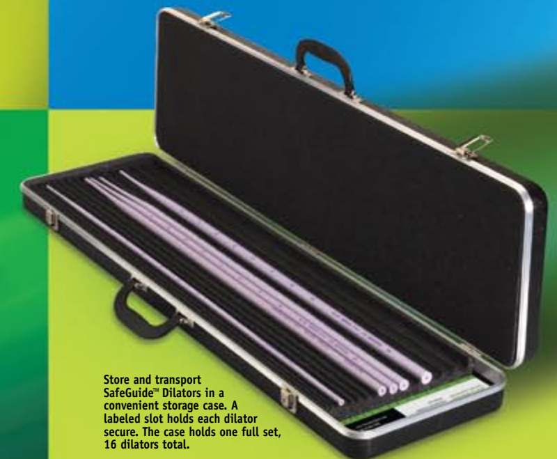
Store and transport SafeGuide™ Dilators in a convenient storage case. A labeled slot holds each dilator secure. The case holds one full set, 16 dilators total.

Optional Marked Spring Tip Guidewire, Cleaning Brush, Cleaning Adapters and Storage Case are available